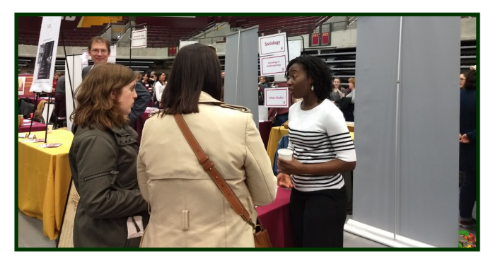
Holiday Party (Fall 2018)